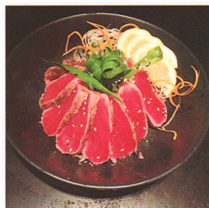
Soft, juicy tuna Best for the summer